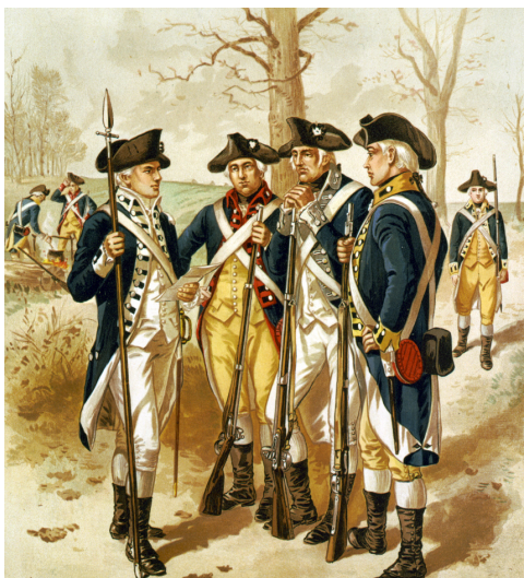
American infantry in the Continental Army during the War for Independence.

ACG: The American Revolution brought forth a number of remarkable men. How did you select the ones you focus on in the book?